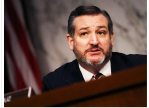
Sen. Ted Cruz (R-TX)

WATCH NOW: Senator Ted Cruz Speaks at OIAC Senate Iran Briefing at http://www.youtube.com/watch?v=IAibPrQfMUU