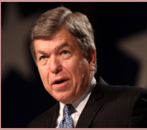
Sen. Roy Blunt (R - MO)