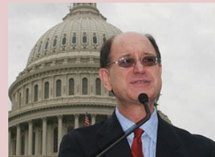
Rep. Brad Sherman (D-CA)