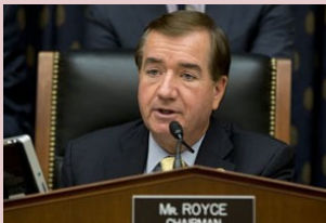
Chairman Ed Royce (R-CA)