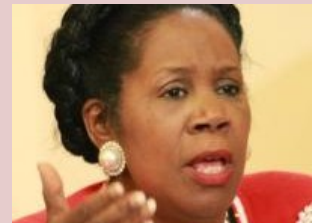
Rep. Sheila Jackson Lee (D-TX)