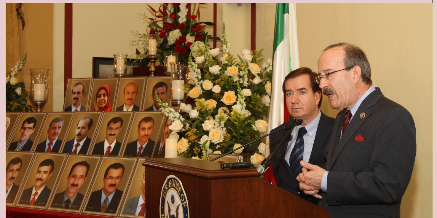
Foreign Affairs Chairman Ed Royce (left) and Foreign Affairs ranking member Eliot Engel (right) stand next to portraits of the victims of the Oct. 29 Camp Liberty attack - November 5, 2015

Related News - https://foreignaffairs.house.gov/press-release/chairman-royce-statement-camp-liberty-attack