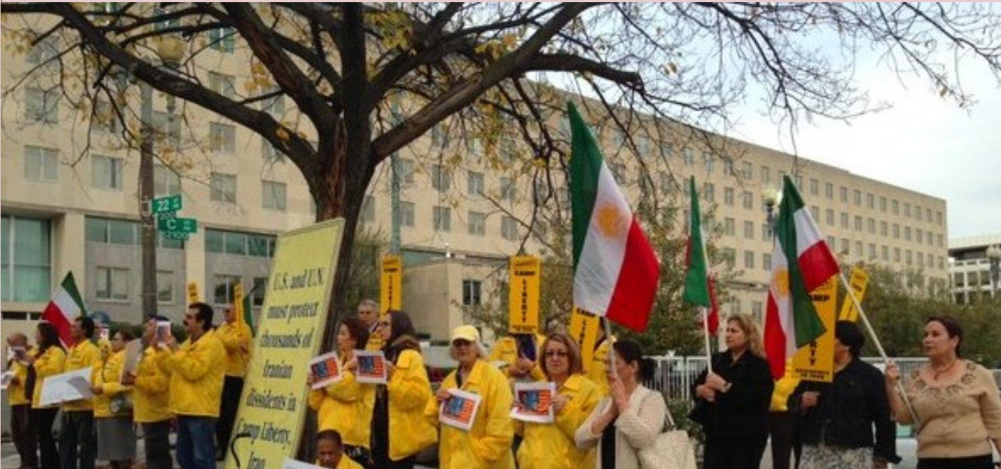
Department of States Washington DC October 29, 2015