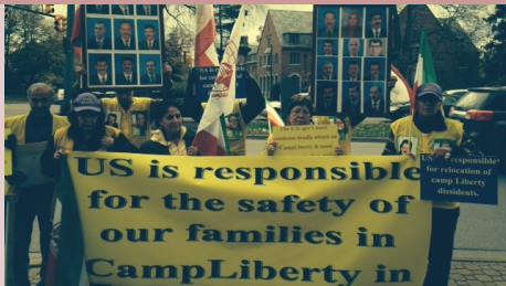
ANN ARBOR, MI