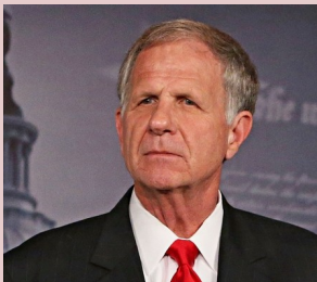
Rep. Ted Poe (R-TX)