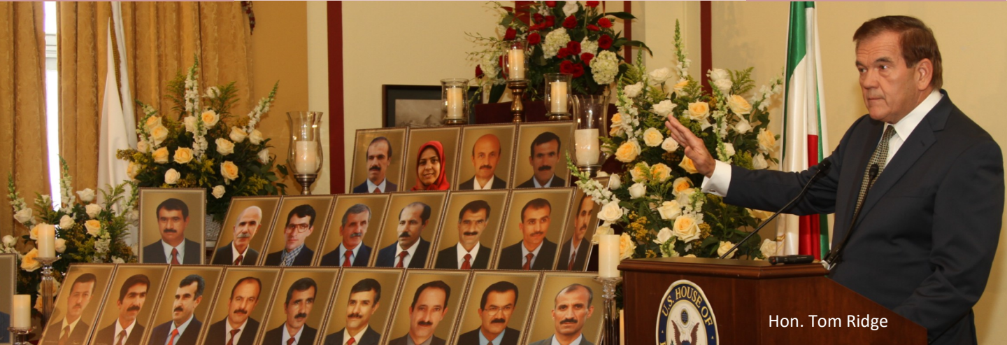
Hon. Tom Ridge