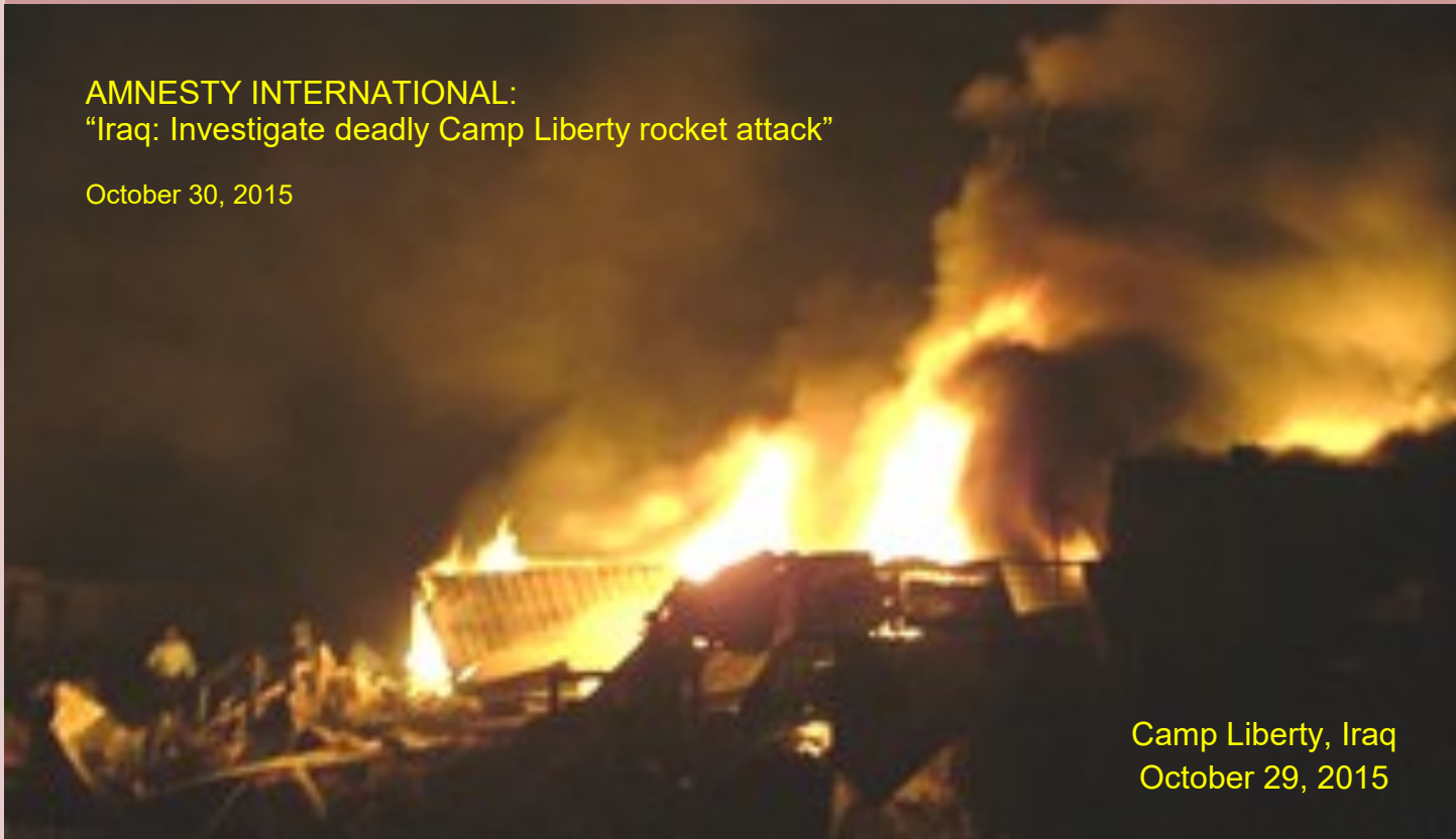
Camp Liberty, Iraq October 29, 2015