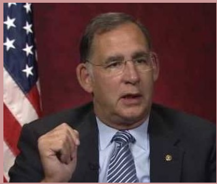
Sen. John Boozman (R-AR)