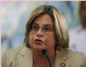
Rep. Ileana Ros-Lehtinen (R-FL)