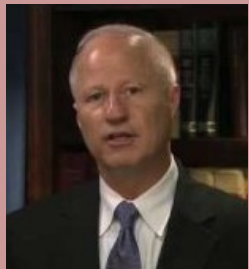
Rep. Mike Coffman (R-CO)