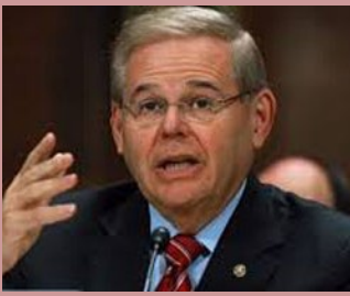
Sen. Robert Menendez (D-NJ)