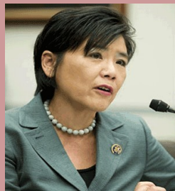
Rep. Judy Chu (D-CA)