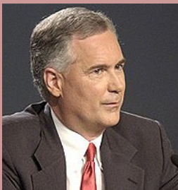
Rep. Tom McClintock (R-CA)