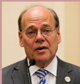
Rep. Steve Cohen (D-TN)