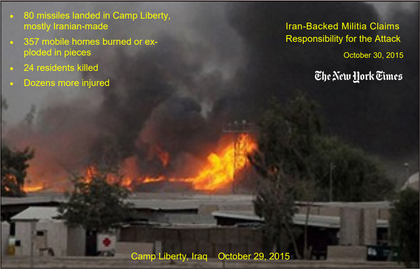
Camp Liberty, Iraq October 29, 2015