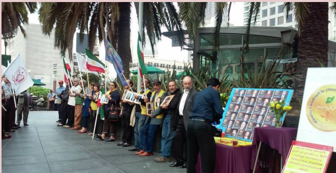
SAN FRANCISCO, CA