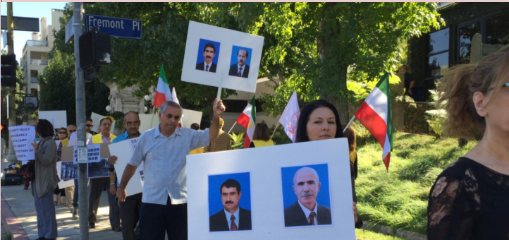
LOS ANGELES, CA