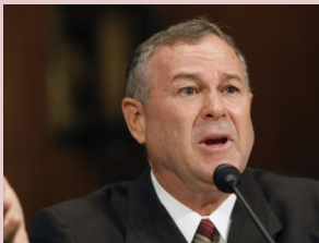
Rep. Dana Rohrabacher (R-CA)