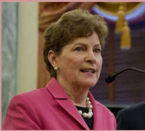
Sen. Jeanne Shaheen (D-NH)