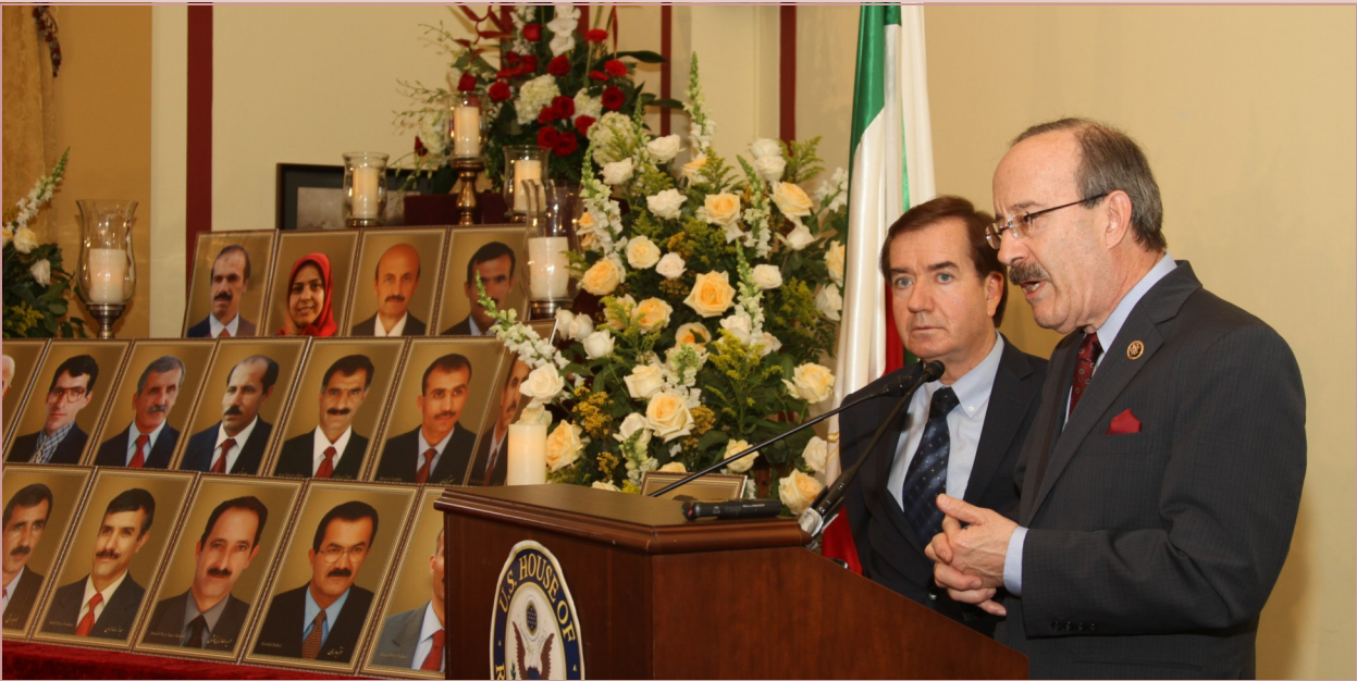
Foreign Affairs Committee Chairman Ed Royce (Left) and Ranking Member Eliot Engel (Right)