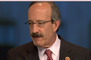
Ranking Member Eliot Engel (D-NY)

Related news: U.S. Rep. Eliot Engel condemns attack on Iranian dissidents in Camp Liberty in Iraq